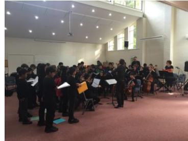
BAND CAMP 2016