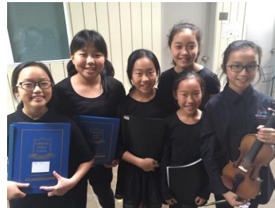
BAND CAMP 2016